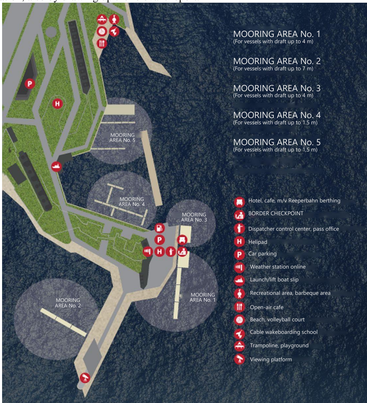
Checkpoint location map for the sea port Big Port of Saint Petersburg

The results of sanitary and quarantine control shall be made by stamping transport documents as appropriate, and in cases established by the laws of the Russian Federation, also by drawing up the relevant report.